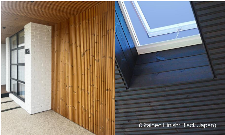
(Stained Finish: Black Japan)

This Thermory® cladding and lining profile is designed specifically for the Australian market and available exclusively through City Timber. Featuring Thermory's hidden fixing system and end matching for fast installation, the Trax design features a contemporary, linear ribbed profile, plus the benefits of a thermally stabilised timber. With increased dimensional stability and durability, the Trax profile is designed to perform in Australian conditions.